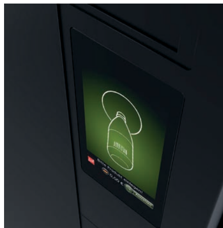
The touch-display is intuitive and easy to use for both the customer and staff