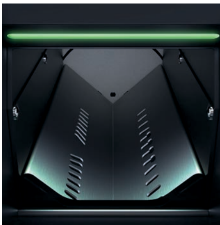
The green LED shows the customer that the SiLine SiOne is ready for use

Can be telemetry enabled so that data can be downloaded from the machine or directly into the machine using a USB-stick. The software can monitor the number of containers and amount of deposits refunded. Operation is simple and effortless.