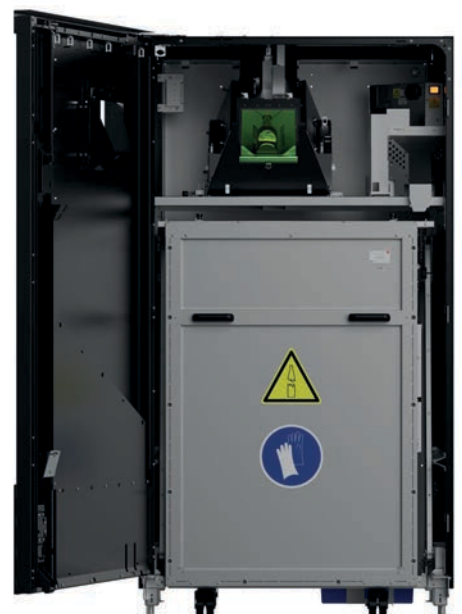
With SiDrop as an option (only possible with SiLine® SiOne M)